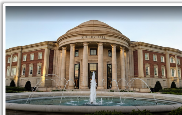
Department of Chemistry & Biochemistry, Shelby Hall